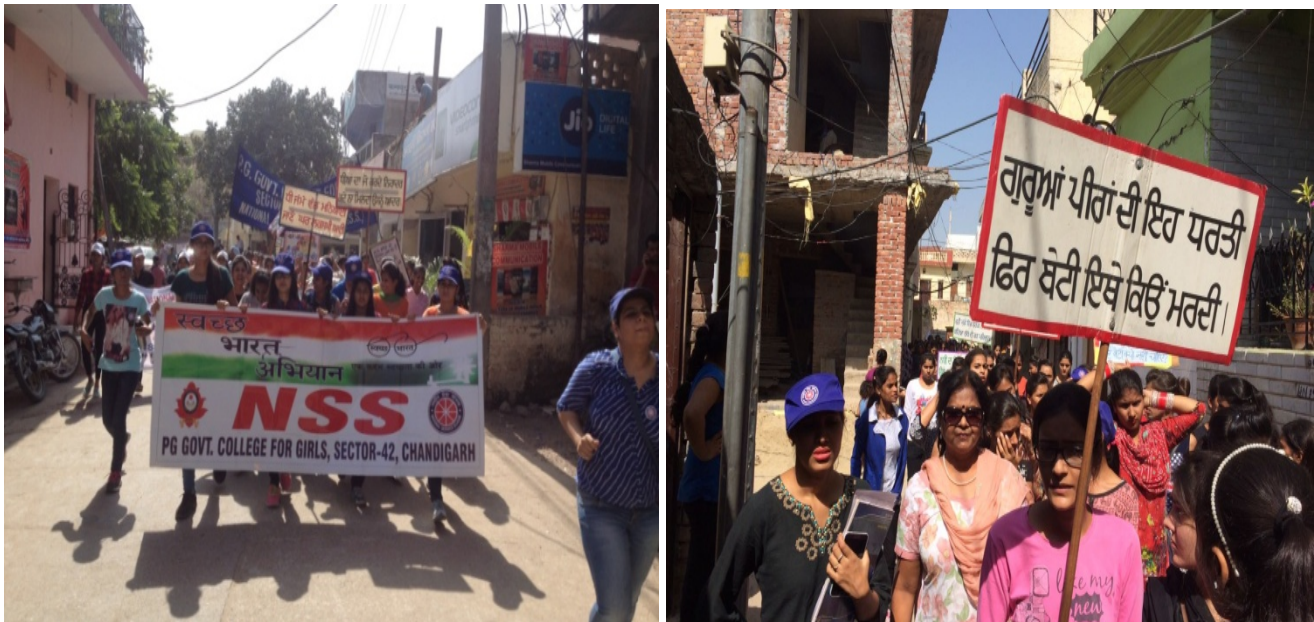
Rally on girl empowerment in village Kajheri