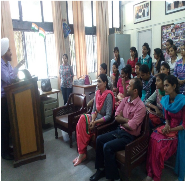
NSS Wing members during a session