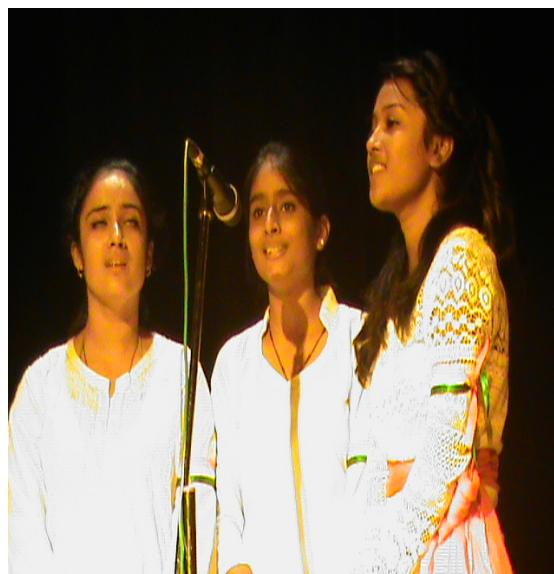
Volunteers performing on Independence Day.