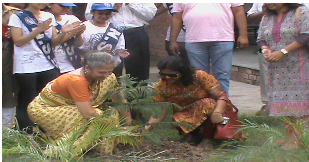
Tree Plantation activity on the occasion of Independence Day.