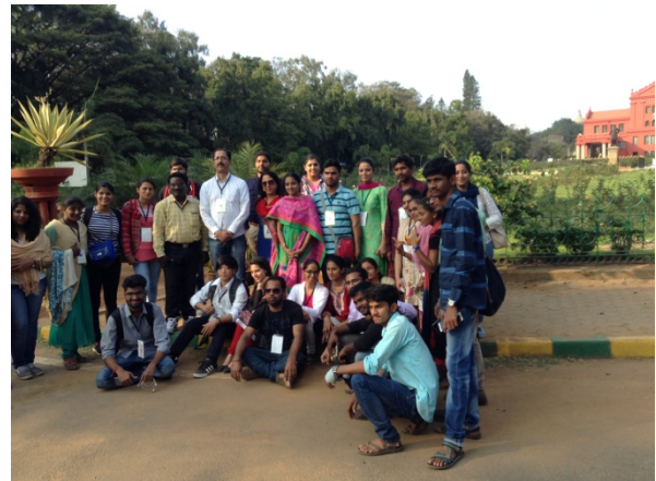
Glimpses of the national level camps attended by the volunteers.