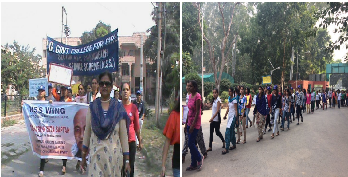
Glimpses of the rally.