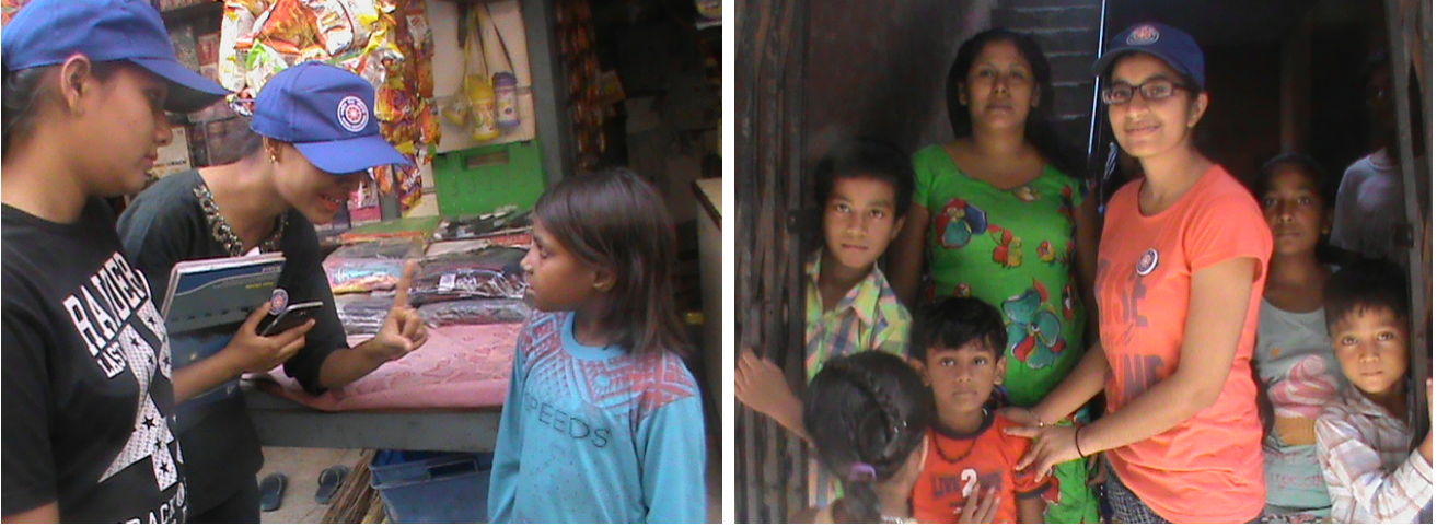
Volunteers during the pulse polio drive