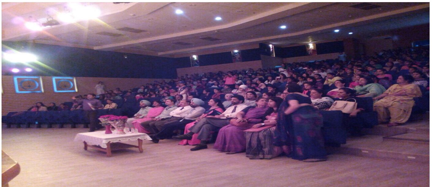
Glimpses of the valedictory function