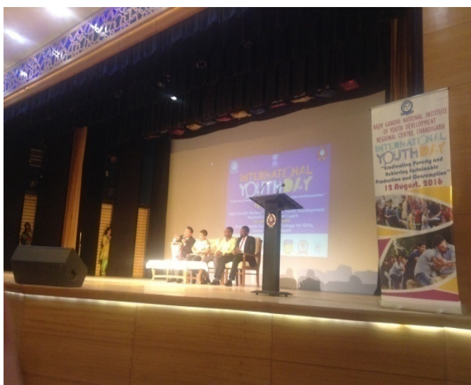
International Delegates taking session.