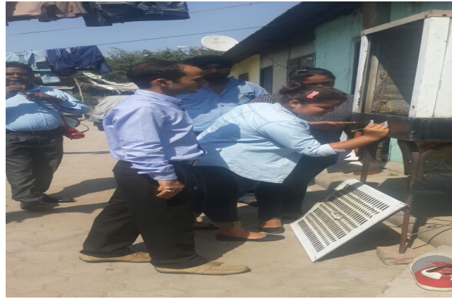
Volunteers in charge during the campaign