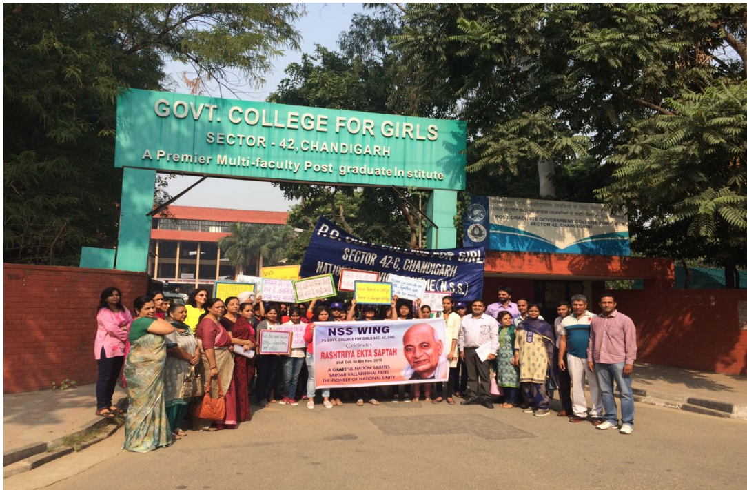
Glimpses of the celebrations within the college premises.