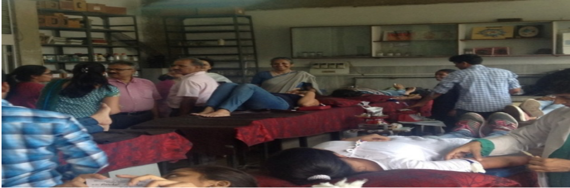
NSS Volunteers donating blood.

performed their duties with full vigour and dedication. NSS Volunteers were the management in charge of this activity. Many volunteers despite performing their duties also undertook the measure of donating blood for a good cause. In addition to the students the Programme Officers along with teachers and faculty members of our institution also became a part of this good cause and donated blood. A certificate of appreciation was provided to the students so as to encourage them to actively be a part of this noble cause along with the refreshment.