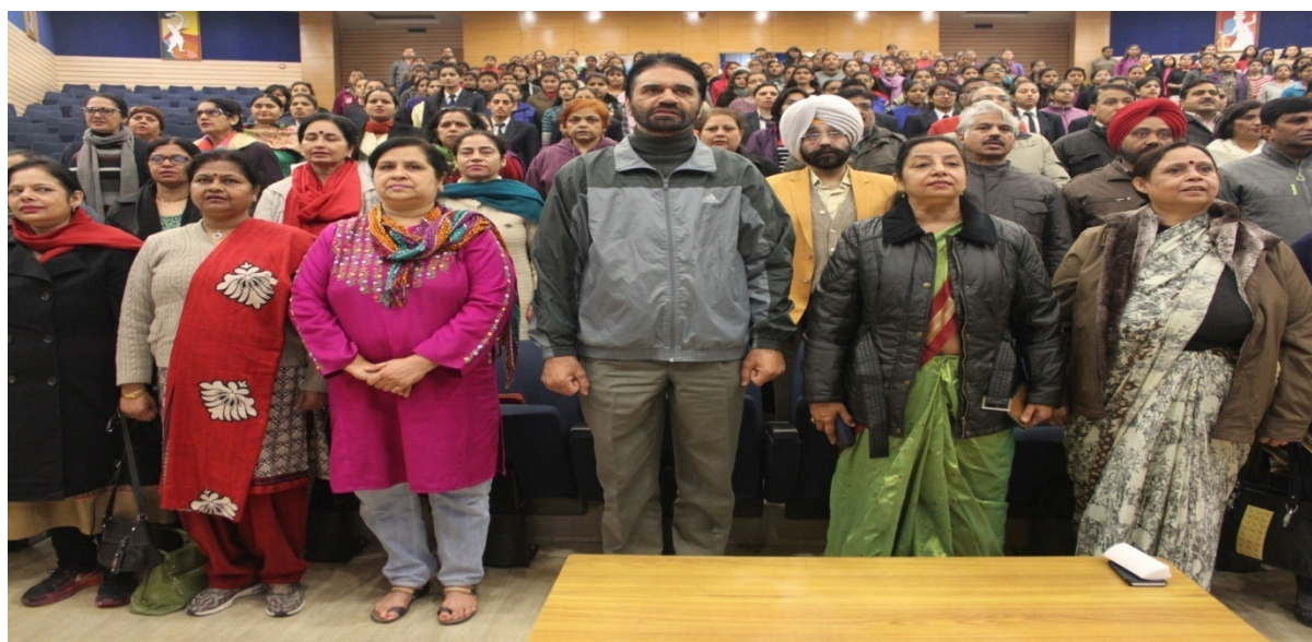
Glimpses of the celebrations of Republic day