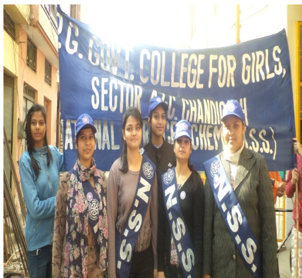
Glimpses of the anti- crackers rally in village Kajheri.