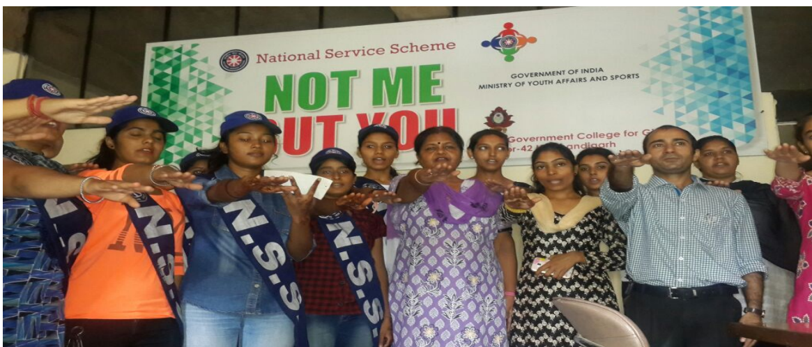
NSS Wing taking pledge on the occasion of Sadbhawana Diwas.