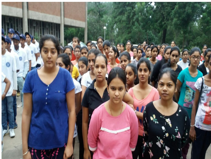
Glimpses of the heritage fest in Capital Complex, Chandigarh