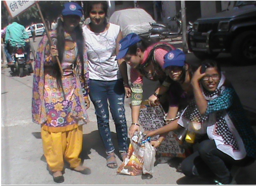
Volunteers during swachh bharat abhiyan mission.