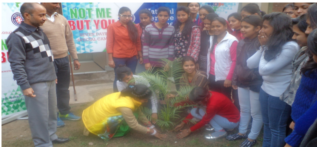
Tree Plantation activity undertaken by the NSS Volunteers.