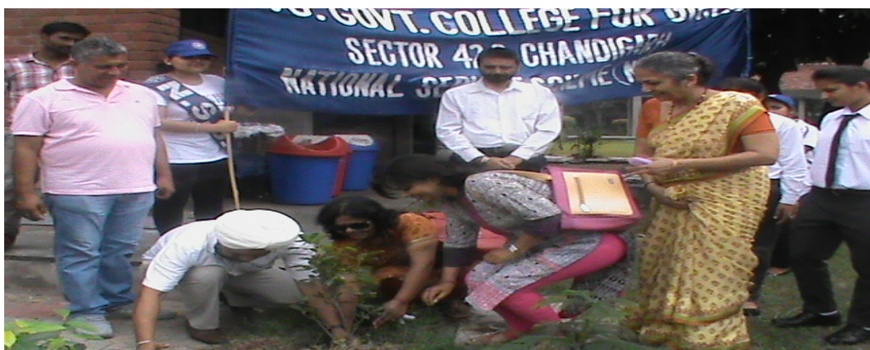
NSS Wing Programme Officers.