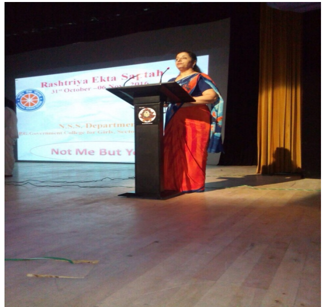
Madam Principal conveying the students