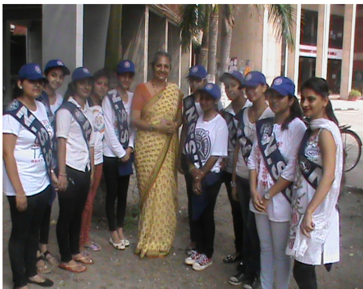
NSS Volunteers with the former principal.

be faithful and loyal towards the country and shall always perform their actions in the best interest of the nation.