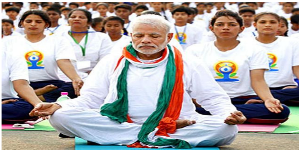
Glimpses of international yoga day 2016.