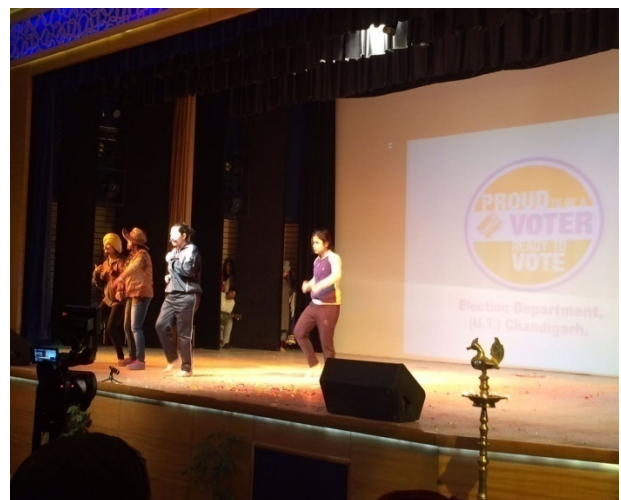
Cultural performances given by the volunteers.