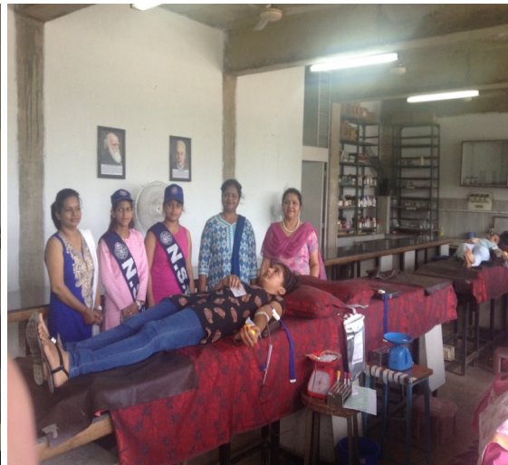
NSS Volunteers managing the camp.