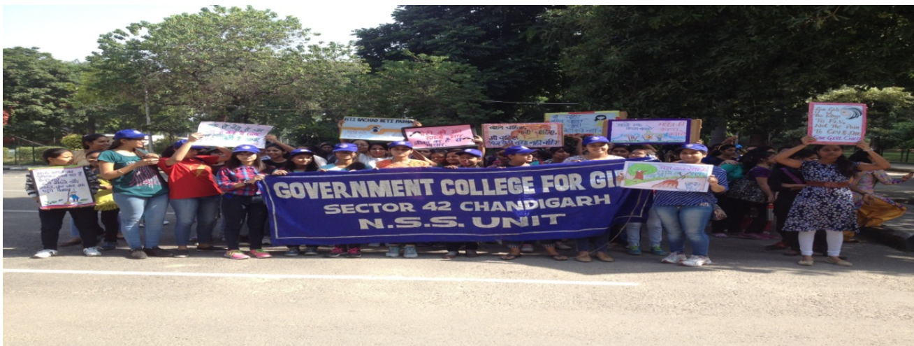
Glimpses of the rally conducted by the volunteers.