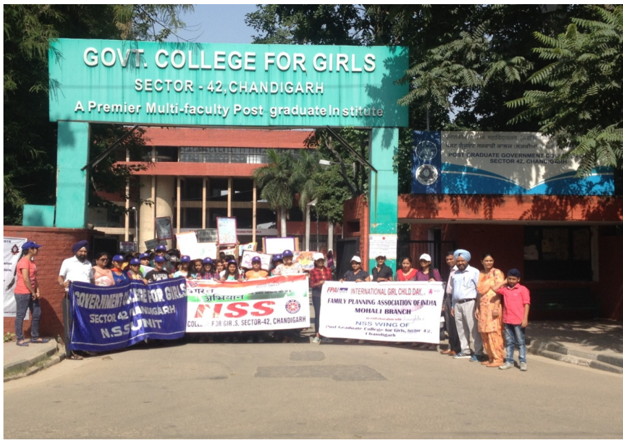
NSS volunteers during the rally.