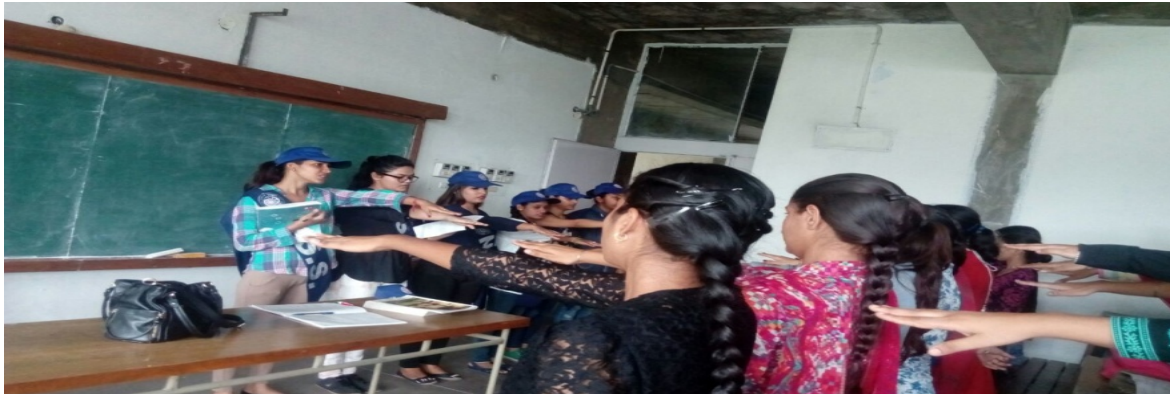
NSS Volunteers taking pledge.