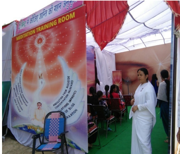
Glimpses of the NSS Day celebrations in the college premises and in Sector 34 Chandigarh