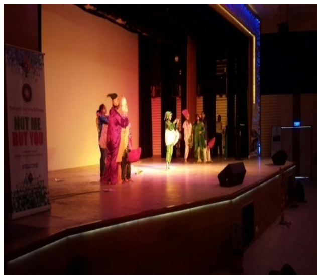
NSS Volunteers showcasing performances.