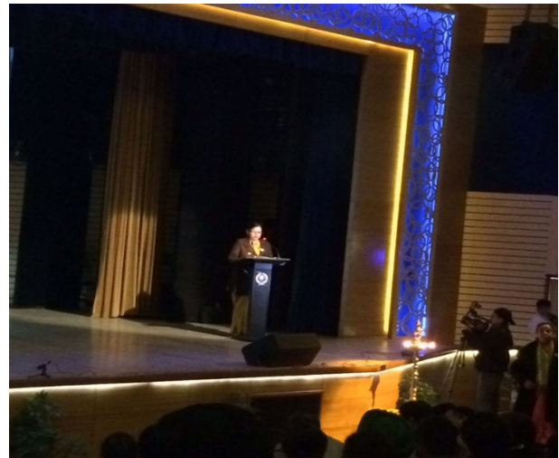
Chief Guest addressing the volunteers