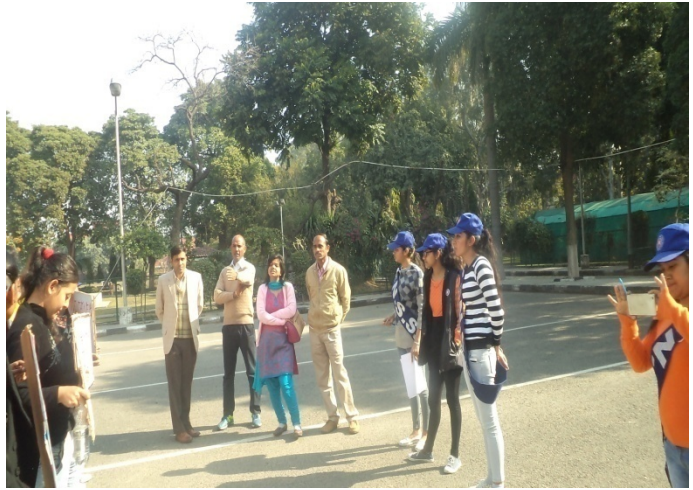
NSS Programme Officers while interacting with the volunteers