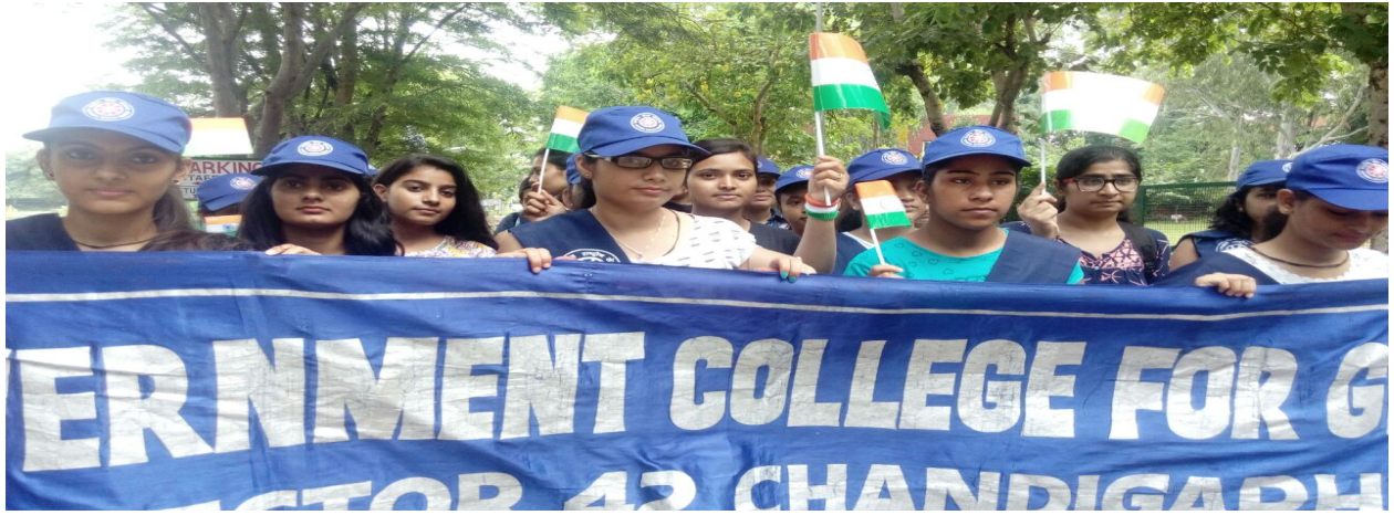
NSS Volunteers conducting a rally in village Kajheri