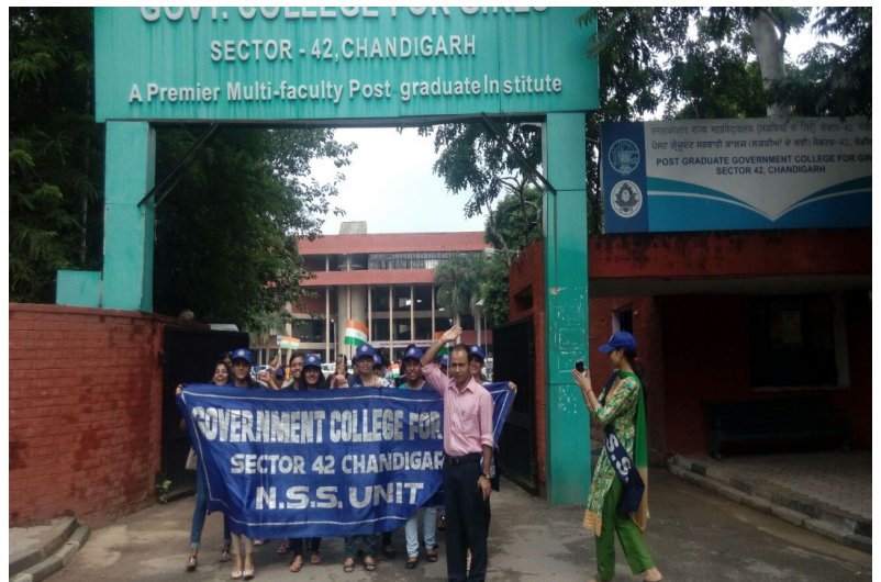
NSS Wing members conducting rally on one week celebration of Independence Day.