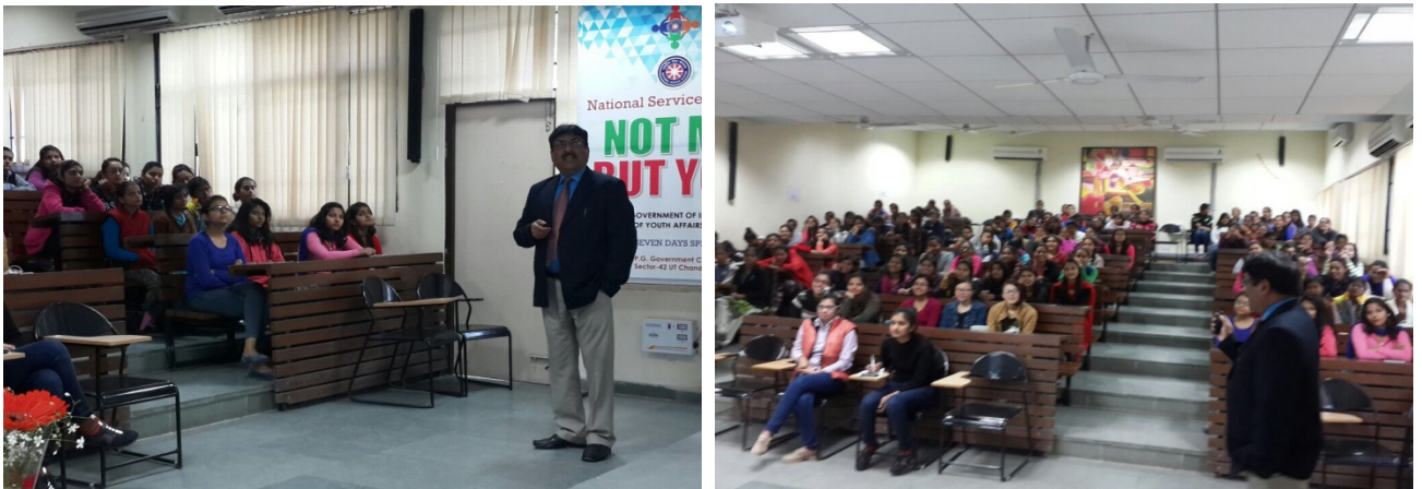
Disaster Management session attended by the volunteers.