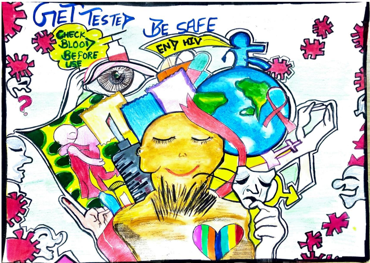
2 nd Prize