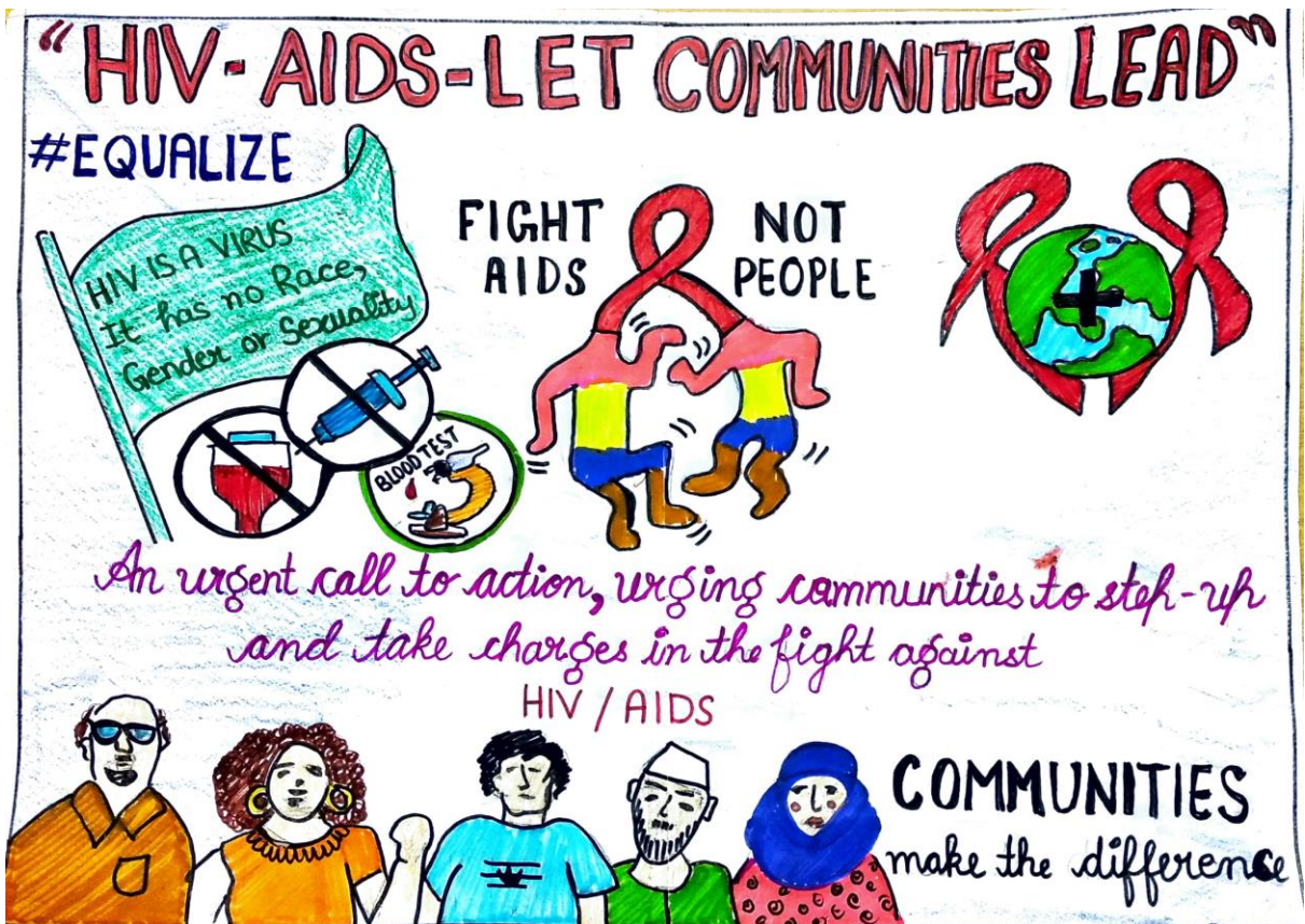
3 rd Prize