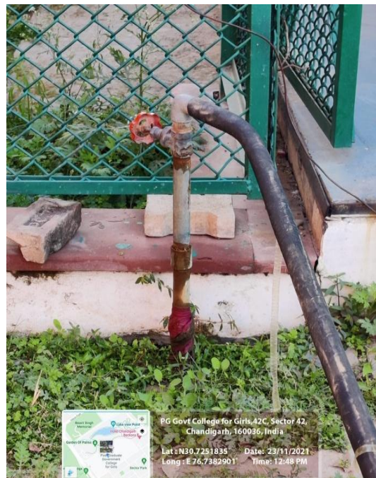
Recycled/ Tertiary Water Point