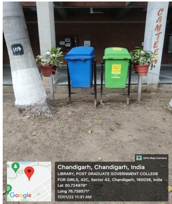
Green and blue dustbins for waste segregation