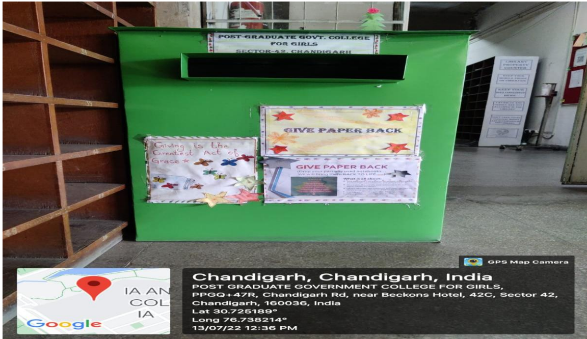
One Sided Used Paper Donation Box