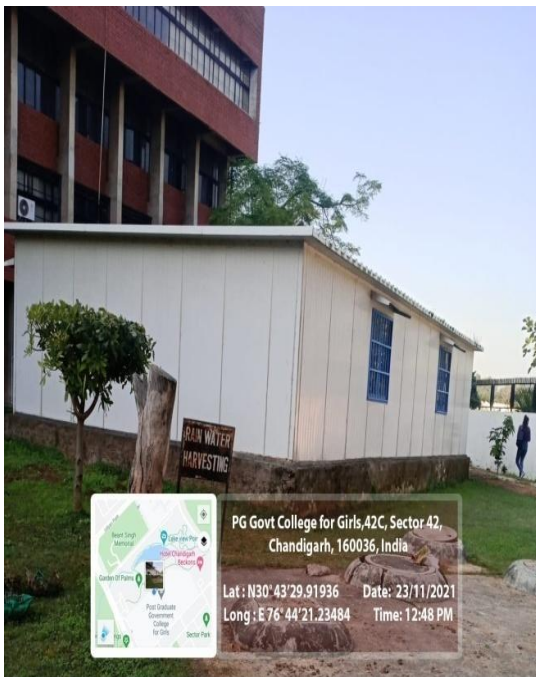
Groundwater recharging through RWH