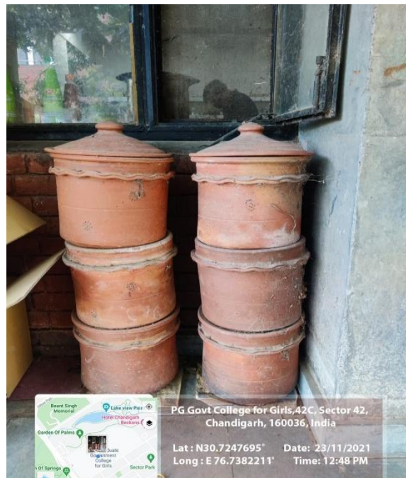
In vessel composting