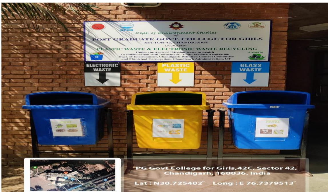
Electronic waste, plastic waste and glass waste segregation unit