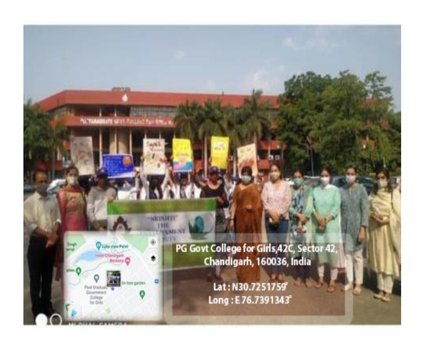
Rally on 'No to Single use Plastic Pollution'