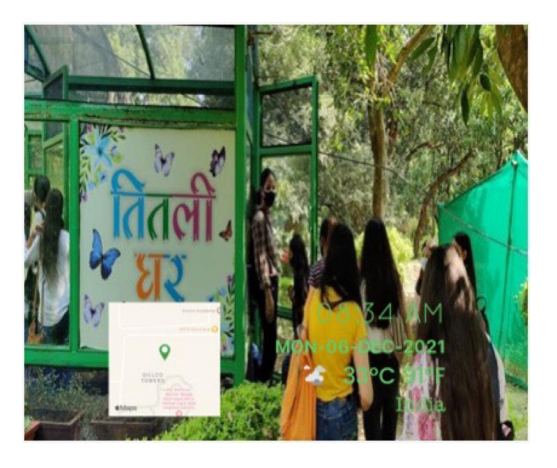
Visit to Butterfly Park, Sector-26 Chandigarh