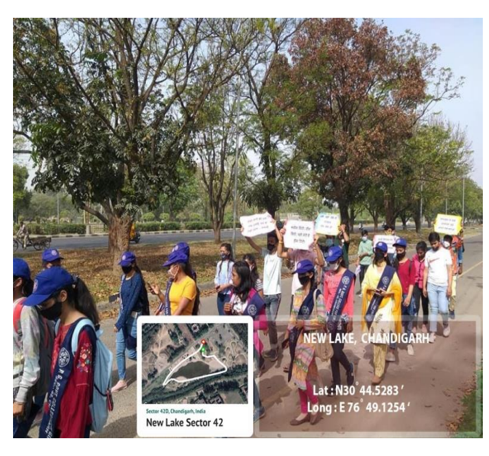
Rally on Anti-Cracker Diwali