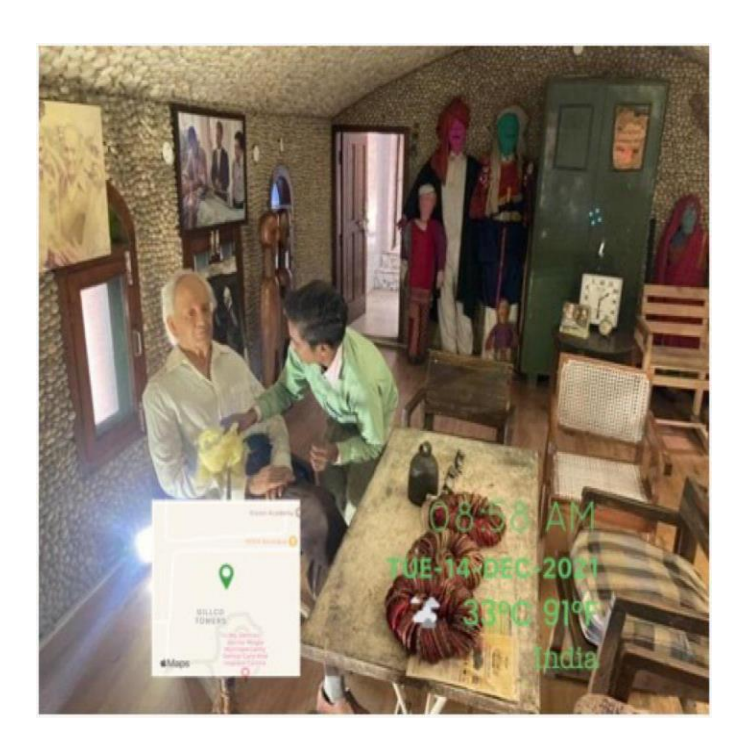
Cleanliness Drive at Rock Garden by NSS Volunteers