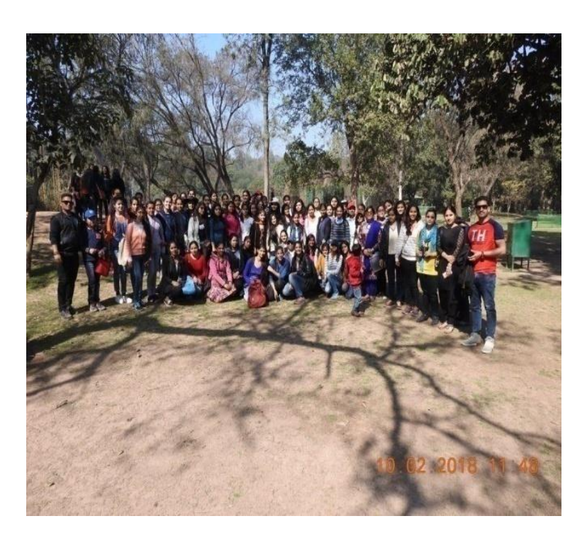
Educational Trip to Chhattbir Dated:10th February 2018