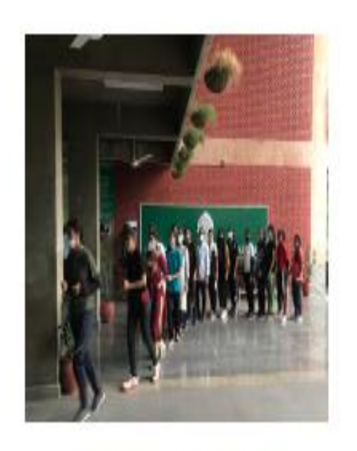
Run for Fit program on 12th Aug, 2021