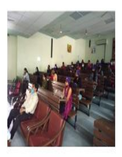
Live Streaming of Prime Minister's Address on 12th March, 2021