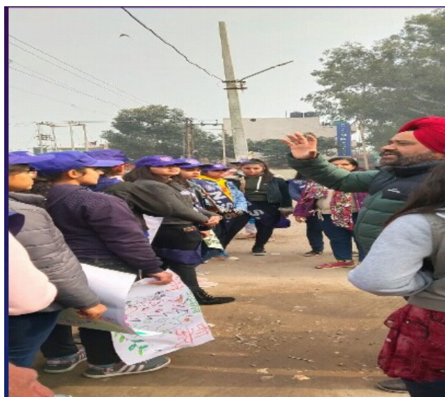
Awareness Rally at Khajeri Village

On the 5th day, an Awareness Rally was organized from college to the adopted Village-Kajheri in order to spread awareness about aids, cleanliness, seasonal flu and waste management. The NSS Volunteers interacted with the people of Kajheri village and gave them tips about how to maintain good health.