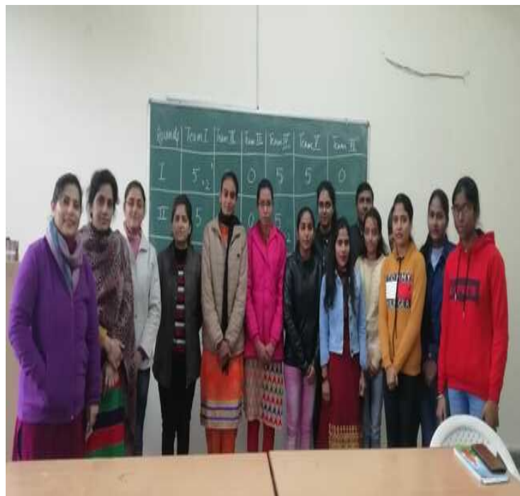
NSS Volunteers participating in Quiz Competition