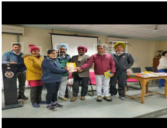
Members of Taraksheel Society