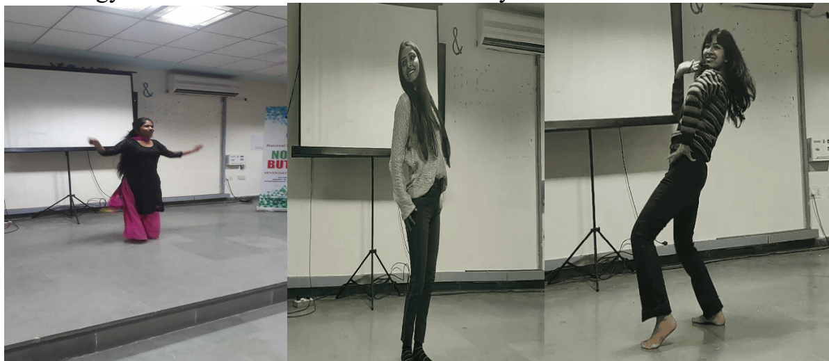
Glimpse from evening Cultural Function.

Next, the volunteers gathered in multimedia room for a cultural session all the volunteers along with Anise is coordinators danced on the Beats of various songs. The energy and enthusiasm in the air was clearly seen.