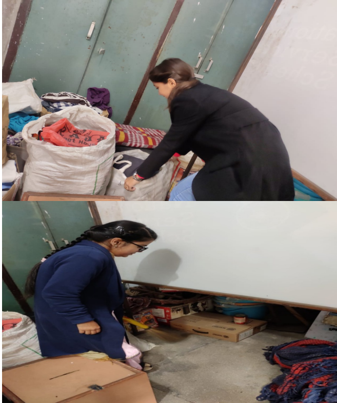
Store cleaning done by NSS volunteers

To instill the idea of 'Swatchh Bharat Swasth Bharat' the NSS volunteers took an initiative in campus cleaning program. They cleaned all the store areas in the campus.