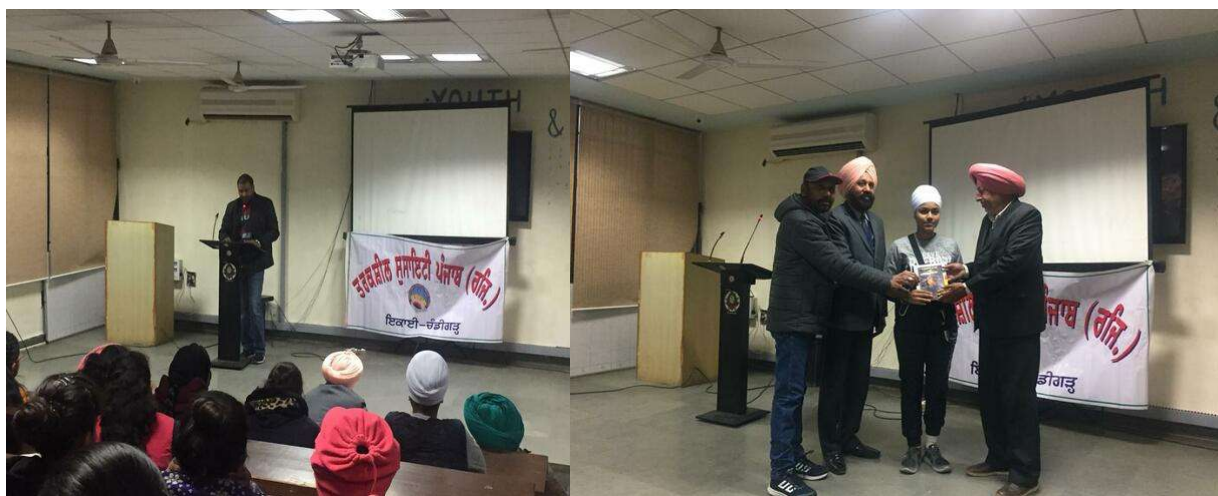
Members of Taraksheel Society interacting with NSS Volunteers

The first session of the sixth day was put on by the Members of Taraksheel Society . The members of Taraksheel Society clarified the myths and superstitions that people have and said that people should become aware and also pass on this knowledge to others. And the shocking fact was that literate people are more to believe in such things. They stated that a scientific temperament is very crucial for a better future of the country.