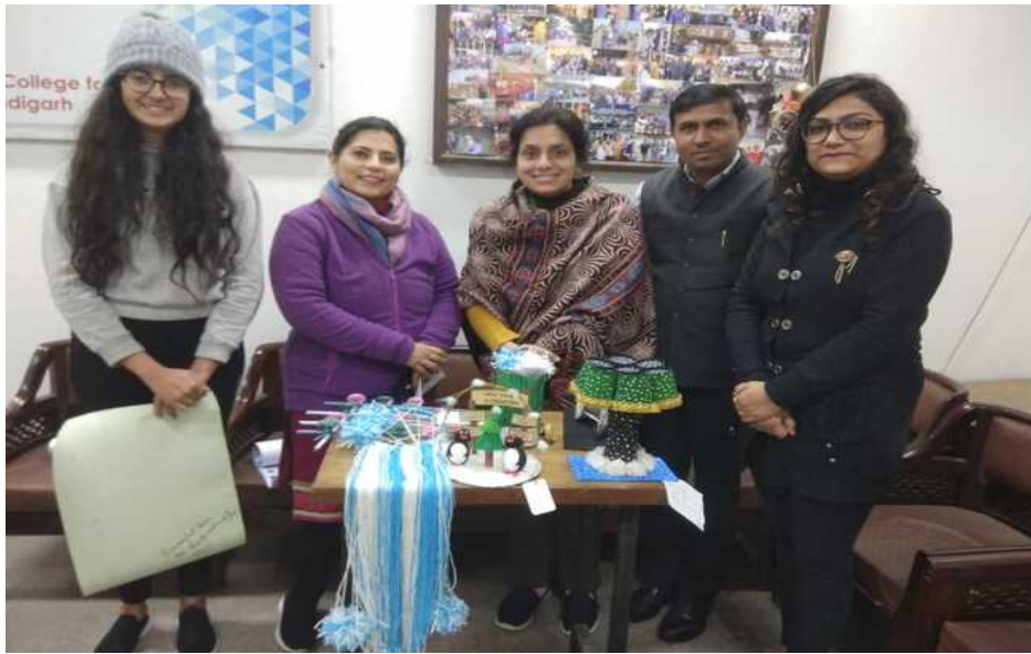
Glimpse from Best out Of Waste Competition