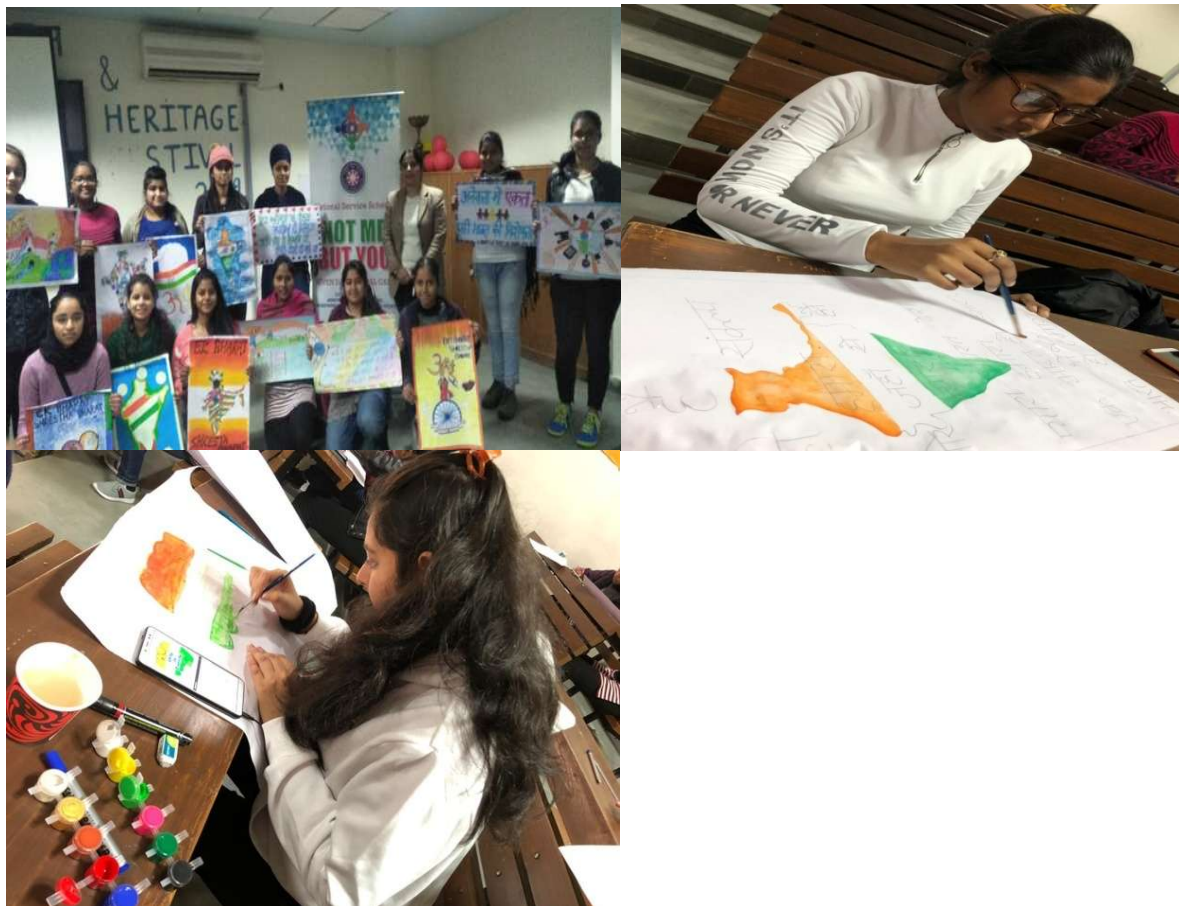
NSS Volunteers participating in Slogan Writing Competition

Next, the volunteers gathered in multimedia room for a cultural session all the volunteers along with Anise is coordinators danced on the Beats of various songs. The energy and enthusiasm in the air was clearly seen.