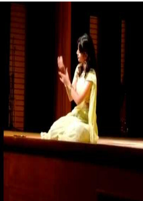
Glimpse from valedictory cultural function.