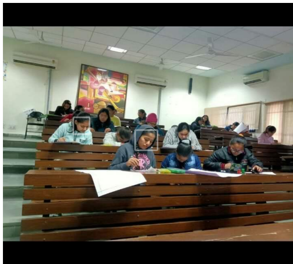
Slogan Writing Competition