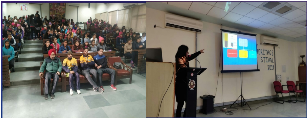
Yoga Therapy Presentation

To instill the idea of 'Swatchh Bharat Swasth Bharat' the NSS volunteers took an initiative in campus cleaning program. They cleaned all the store areas in the campus.