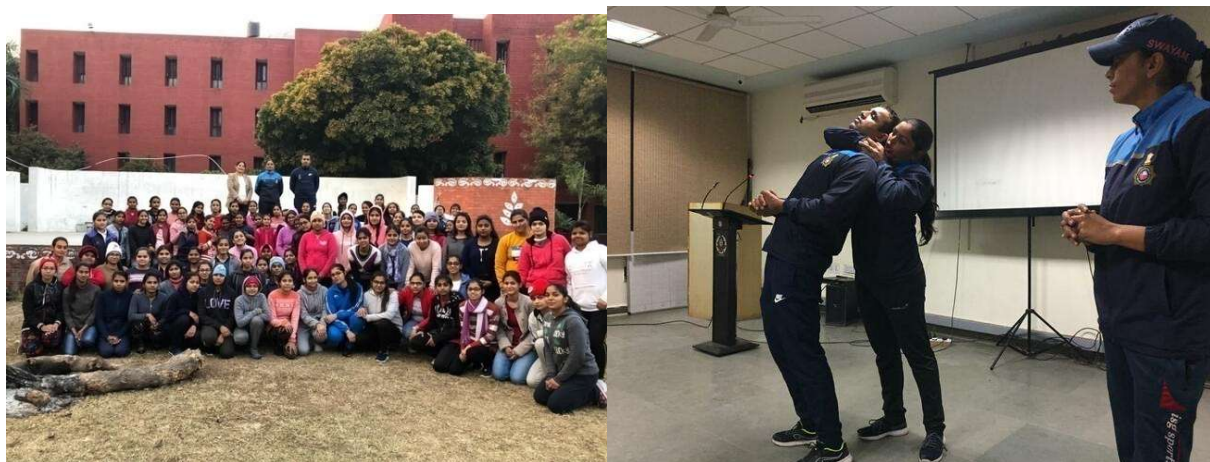
Glimpse from NSS Volunteers practicing self defense.

In the defense class the volunteers were taught about the punches, the eye shoots and how an attack can be blocked.