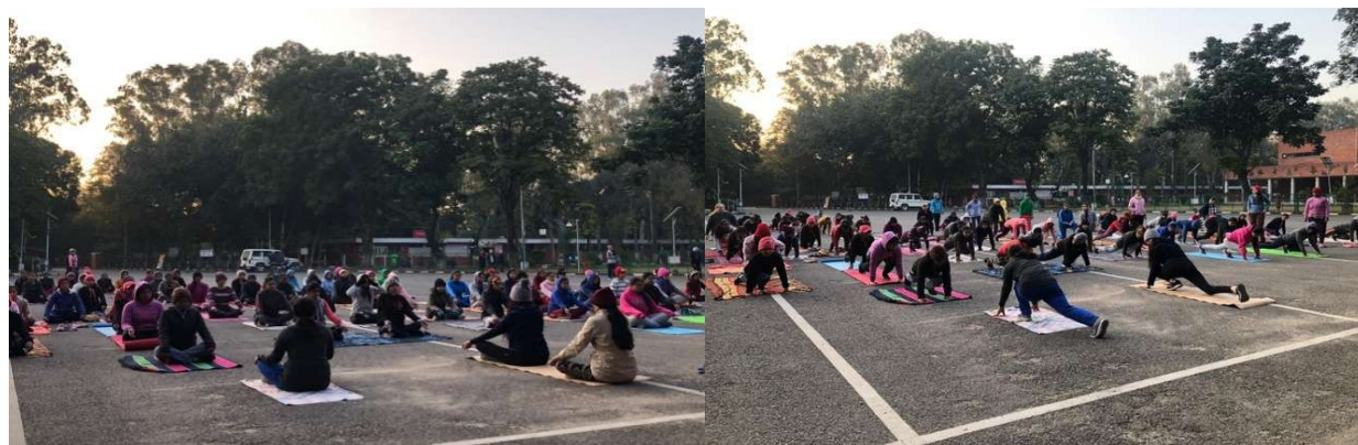
NSS Volunteers performing Yoga early morning

The Bhagavad Gita states, "Yoga is the Journey of the Self to the Self, through the Self." Therefore, the NSS Volunteers started their day by practicing Yoga.