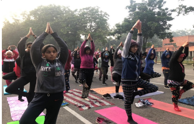
Volunteers doing Exercise and Yoga