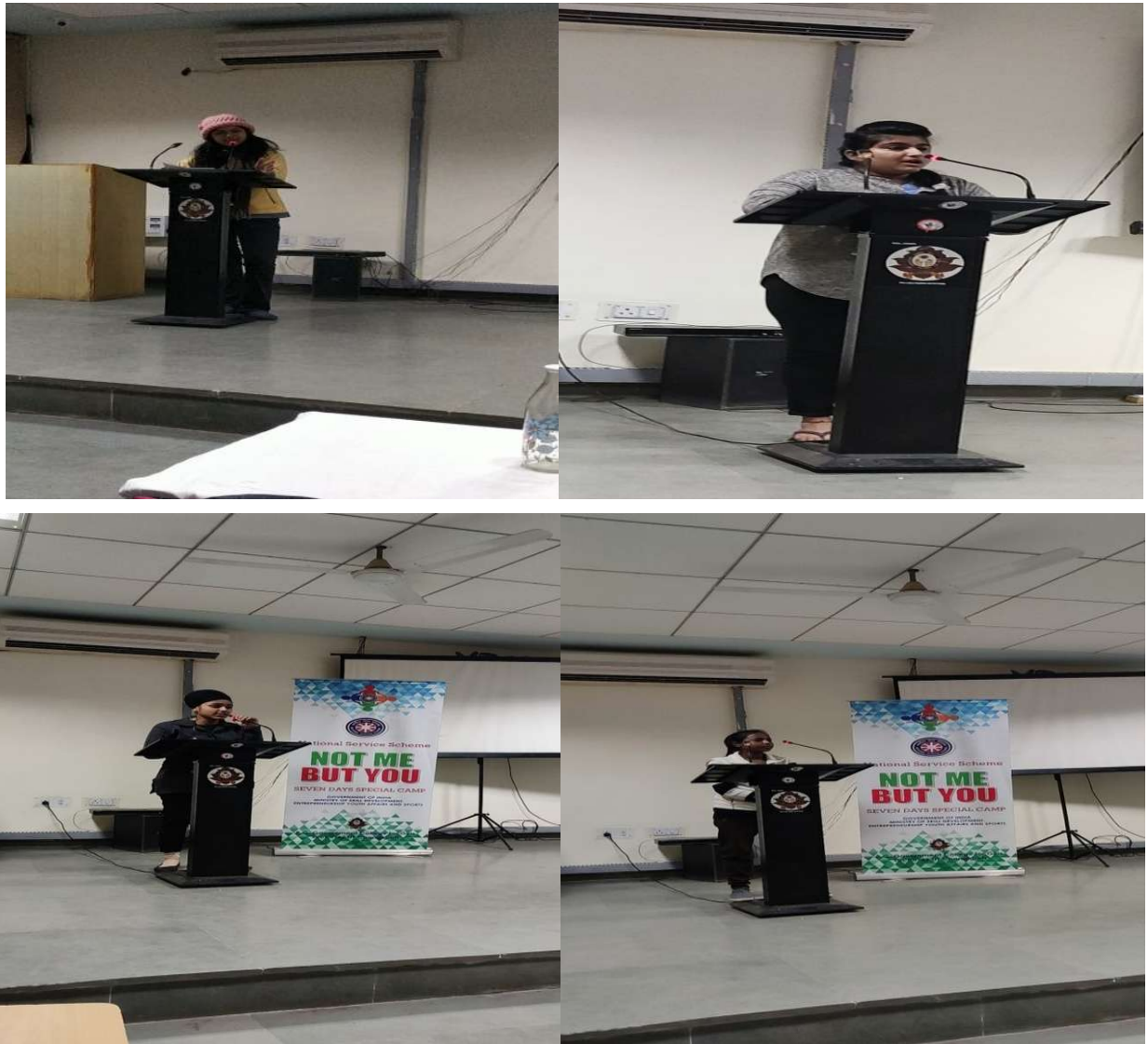
Glimpse from Poetry Competition.

Later, a poetry competition was organized for the volunteers on the topic "Ek Bharat Shreshth Bharat." The volunteers participated with full zest and recited various poems in their melodious voices.