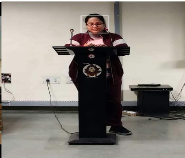
Poem Recitation Competition

After the daily routine, the volunteers gathered in multimedia room and showcased their various talents by participating in the Poem competition and Slogan Writing Competition.