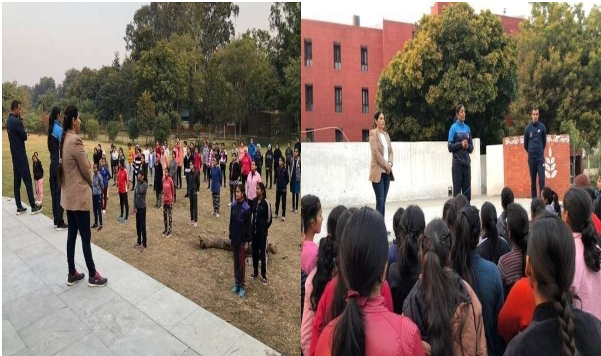
NSS Volunteers attending Self Defense Class

At 4 p.m. The volunteers assembled in the ground to attend the defense class. The defense class was given by the main objective of the class was to make volunteers strong both physically and mentally