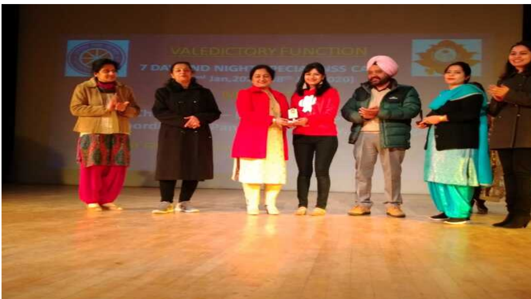
Glimpse from the Prize Distribution Ceremony

After the valedictory Function all the NSS volunteers had lunch and bid adieu to the camp with life long memories and various life lessons.