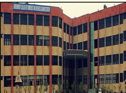
GOVERNMENT COLLEGE OF COMMERCE AND BUSINESS ADMINISTRATION, SECTOR 50, CHANDIGARH