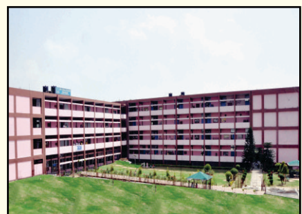
DEV SAMAJ COLLEGE FOR WOMEN SECTOR 45, CHANDIGARH