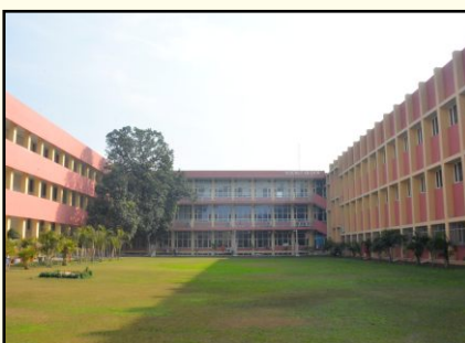
GOSWAMI GANESH DUTTA S.D. COLLEGE SECTOR 32, CHANDIGARH