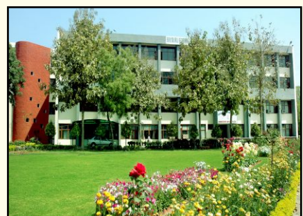
SRI GURU GOBIND SINGH COLLEGE SECTOR 26, CHANDIGARH