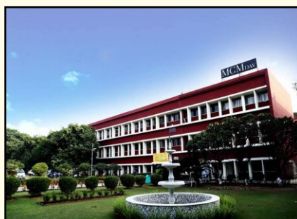
MEHR CHAND MAHAJAN DAV COLLEGE FOR WOMEN SECTOR 36, CHANDIGARH