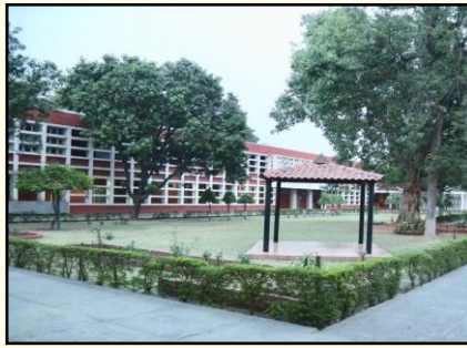
POST GRADUATE GOVERNMENT COLLEGE FOR GIRLS SECTOR 11, CHANDIGARH