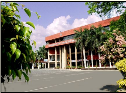
POST GRADUATE GOVERNMENT COLLEGE FOR GIRLS SECTOR 42, CHANDIGARH