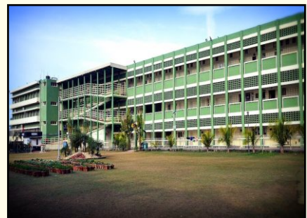
DAV COLLEGE SECTOR 10, CHANDIGARH