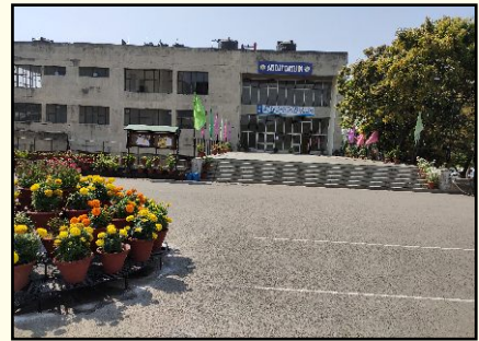
POST GRADUATE GOVERNMENT COLLEGE SECTOR 46, CHANDIGARH