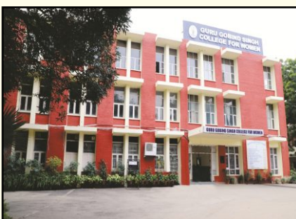
GURU GOBIND SINGH COLLEGE FOR WOMEN SECTOR 26, CHANDIGARH