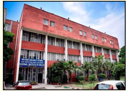
REGIONAL INSTITUTE OF ENGLISH SECTOR 32, CHANDIGARH