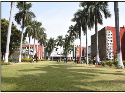
POST GRADUATE GOVERNMENT COLLEGE SECTOR 11, CHANDIGARH