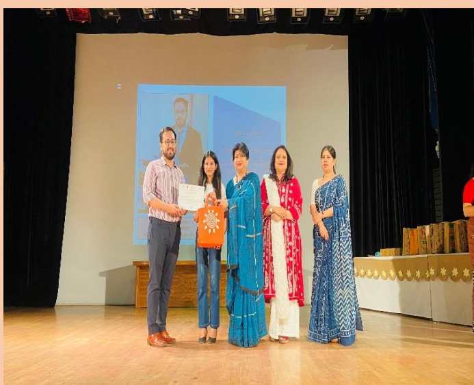
Appreciation Certificates to volunteers