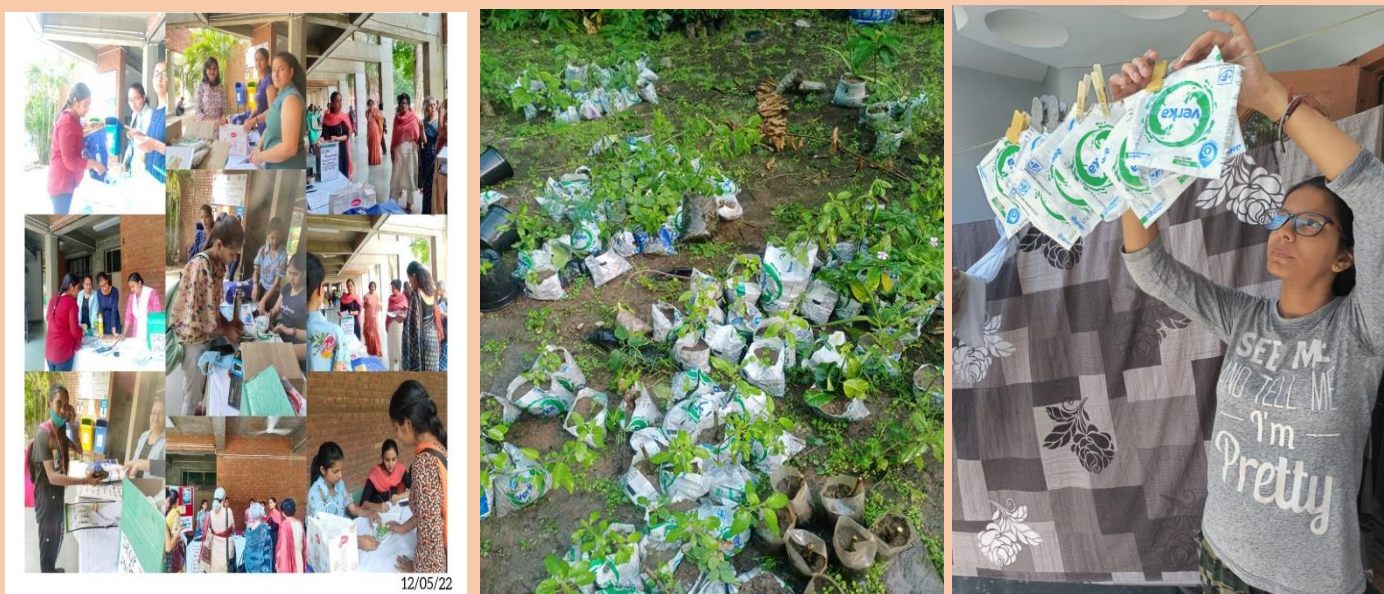
Single use plastic collection Drive and reusing as alternate of black panni