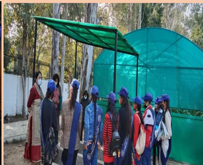
Demonstration of Vermicompost