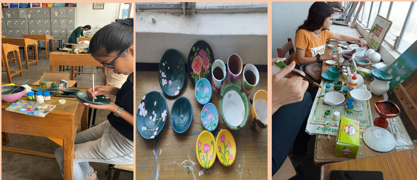
Skill Based Workshop on sustainable reuse of resources