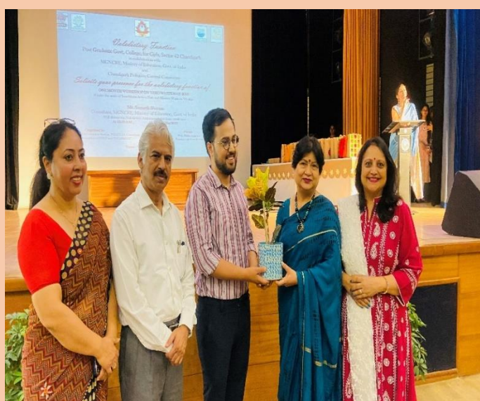
Zero Waste Workshop