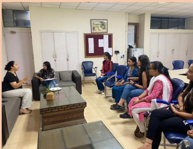
Monthly Meeting of SSHG and Nodal officer