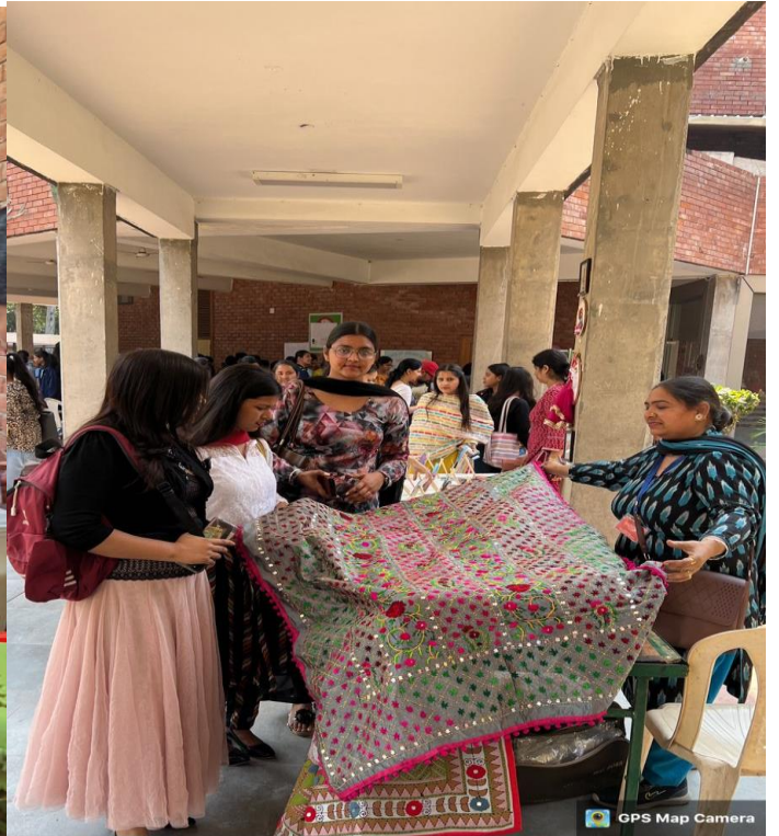
Chandigarh, CH, India Sector 42D, Chandigarh, 160036, CH, India Lat 30.724952, Long 76.738553 03/10/2023 12:37 PM GMT+05:30 Note : Captured by GPS Map Camera