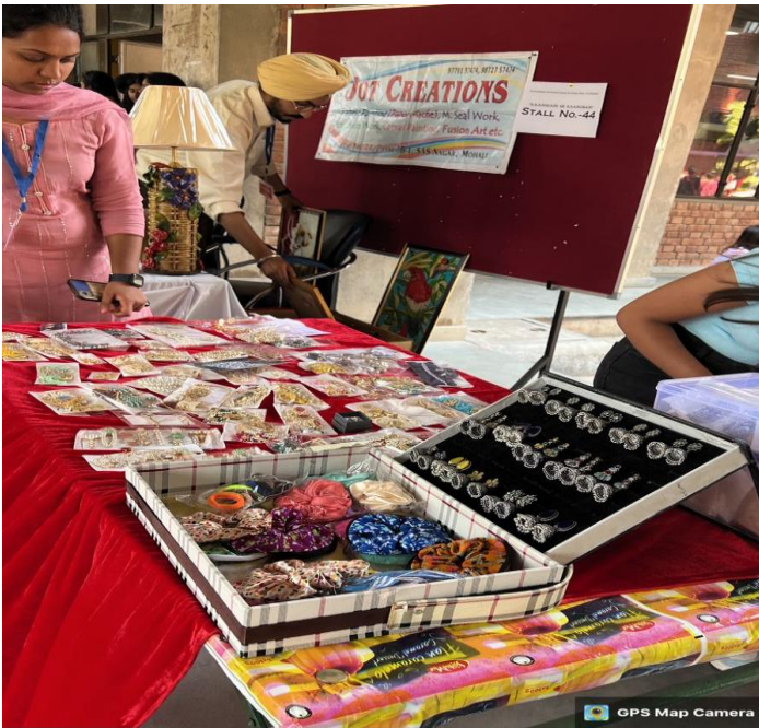
Chandigarh, CH, India Sector 42D, Chandigarh, 160036, CH, India Lat 30.725353, Long 76.738452 03/10/2023 12:35 PM GMT+05:30 Note : Captured by GPS Map Camera