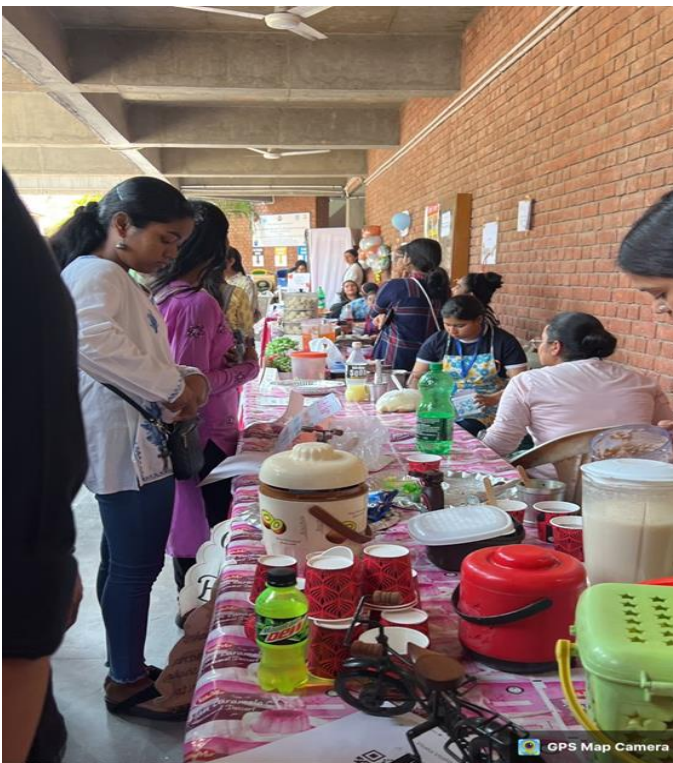
Chandigarh, CH, India Sector 42D, Chandigarh, 160036, CH, India Lat 30.725118, Long 76.738532 03/10/2023 12:36 PM GMT+05:30 Note : Captured by GPS Map Camera