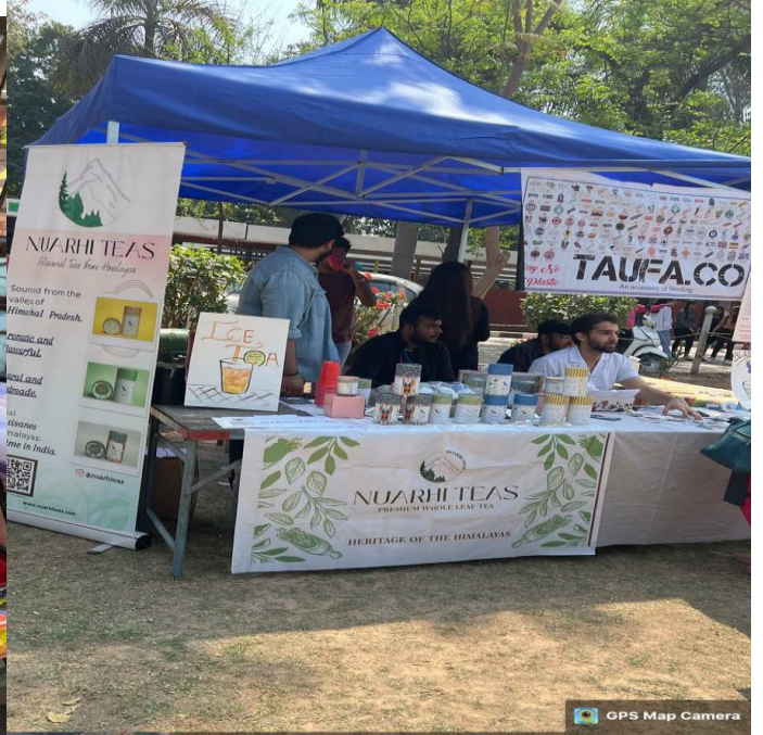
Chandigarh, CH, India Sector 42D, Chandigarh, 160036, CH, India Lat 30.724882, Long 76.738744 03/10/2023 12:38 PM GMT+05:30 Note : Captured by GPS Map Camera