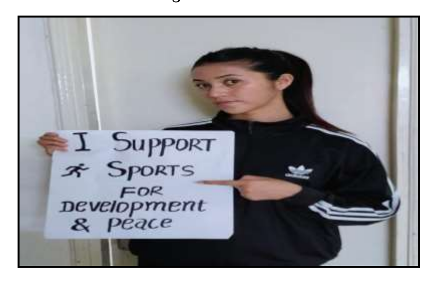
Celebration of International Day of Sports for Development and Peace 6th April 2018-19