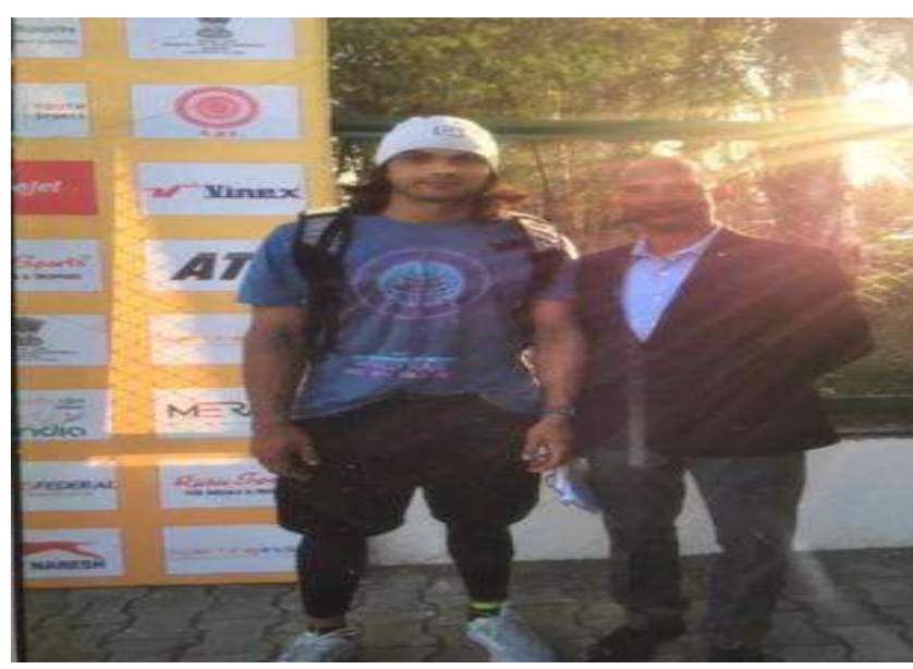
Neeraj Chopra Olympic Gold Medalist