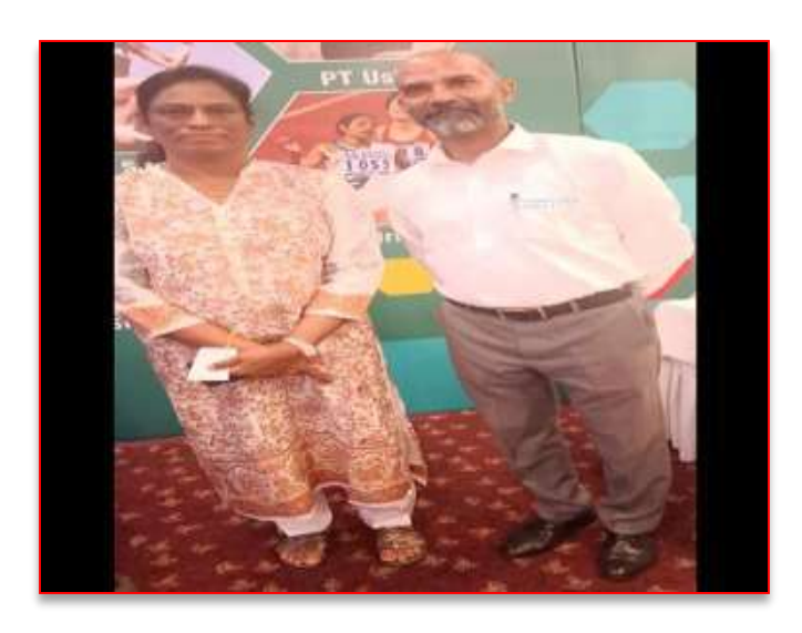
Golden Girl P.T. Usha