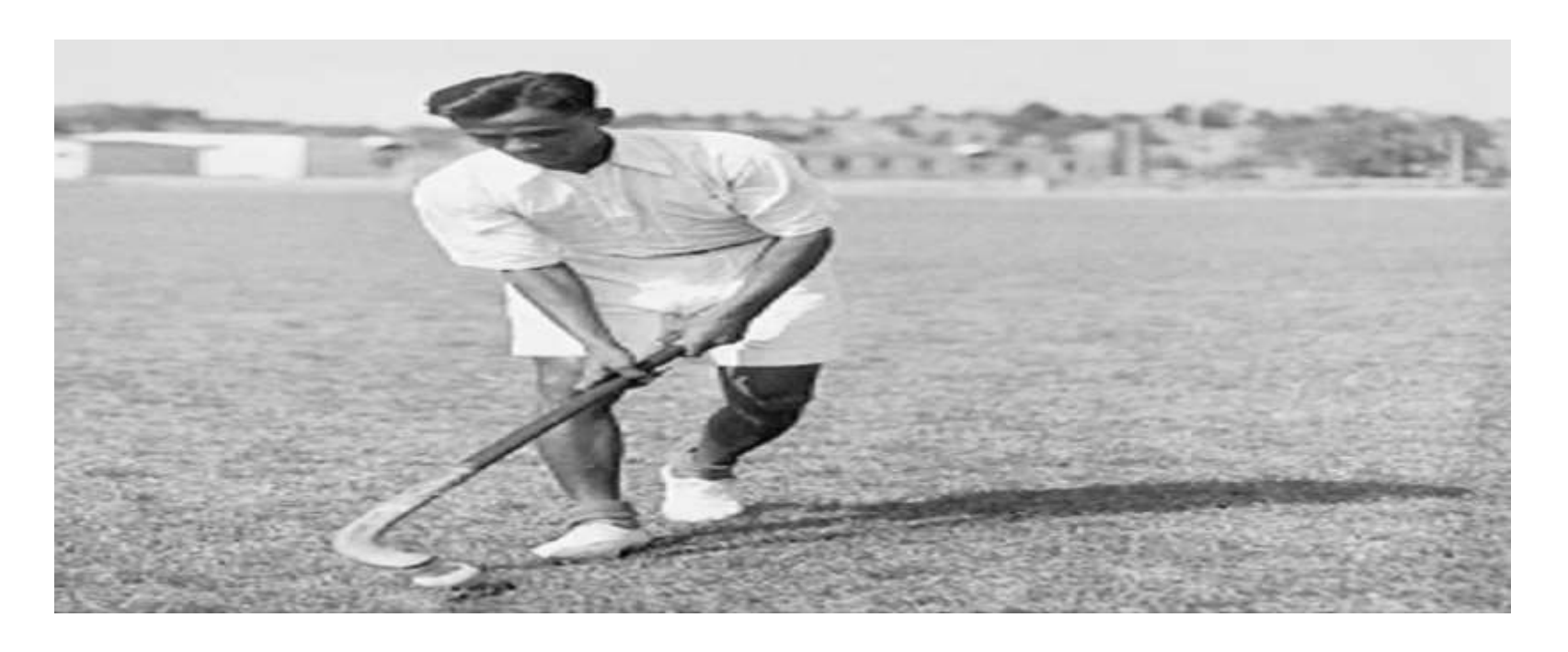
Celebration of "National Sports Day" under the aegis of Olympic movement Society on 29th August, 2022