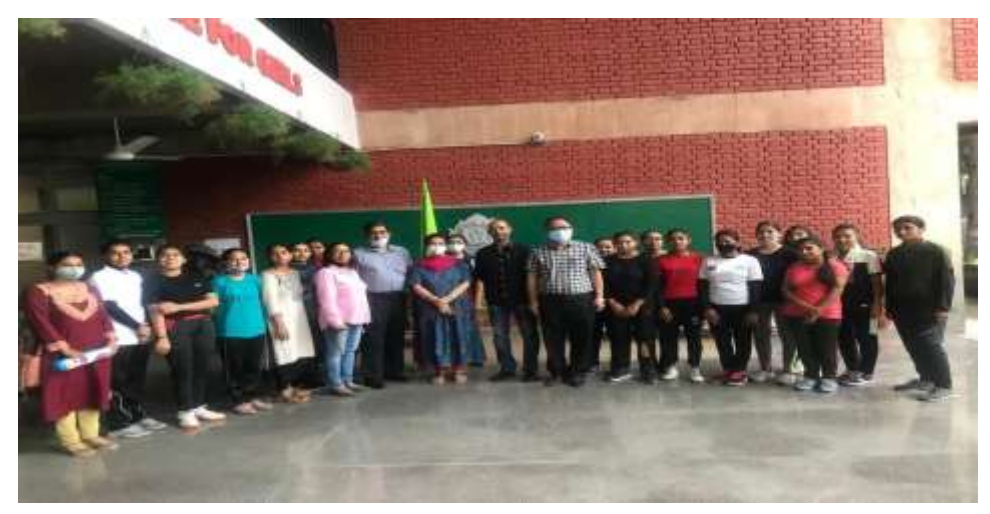
Bharat ki Aazadi ki Amrutmahotsav Fitness Run on 21 August, 2021 organized by Olympic Movement Society