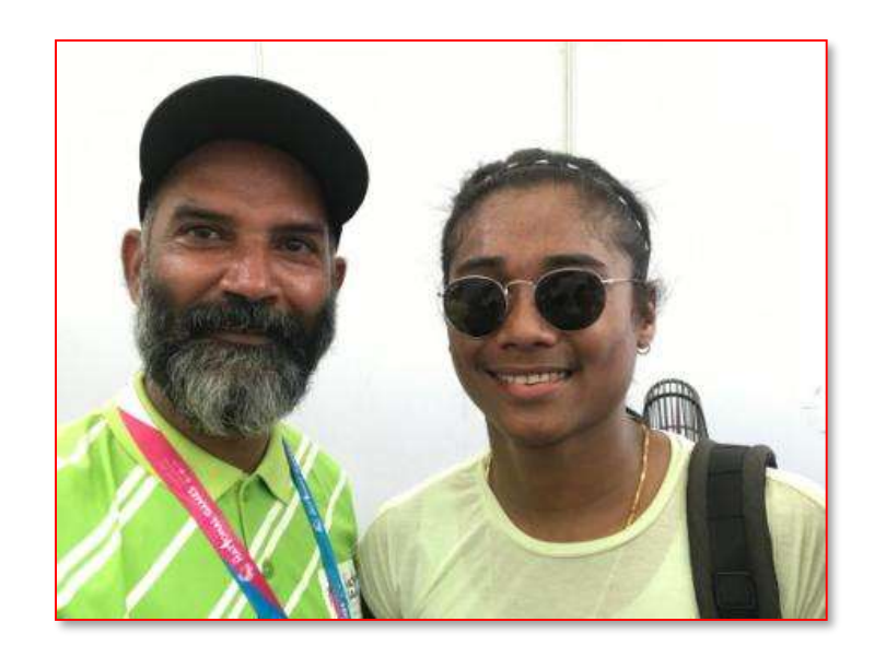
Hima Das 400 mtr World Champion