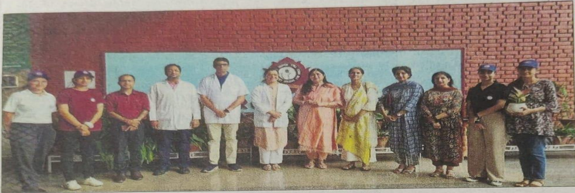
Participants of the first-aid training camp at the PGGCG-42 on Friday.