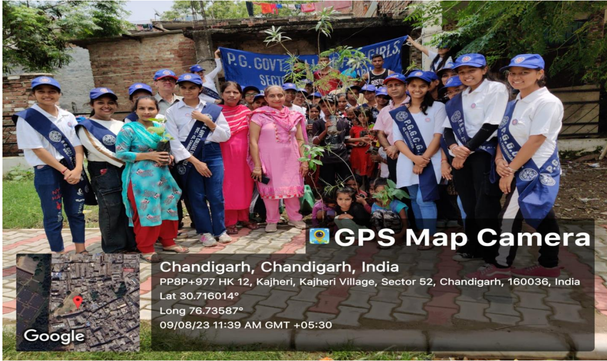
TREE PLANTATION DRIVE IN ADOPTED VILLAGE KAJHERI