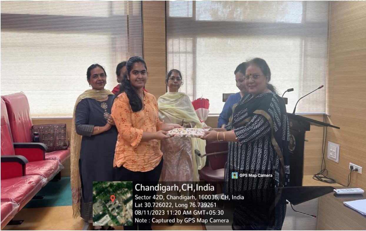
AN INTER-CLASS SPEECH COMPETITION