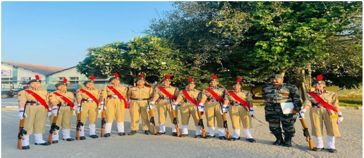
● Guard of Honor Cadets in Annual Training Camp NCC Academy, Ropar