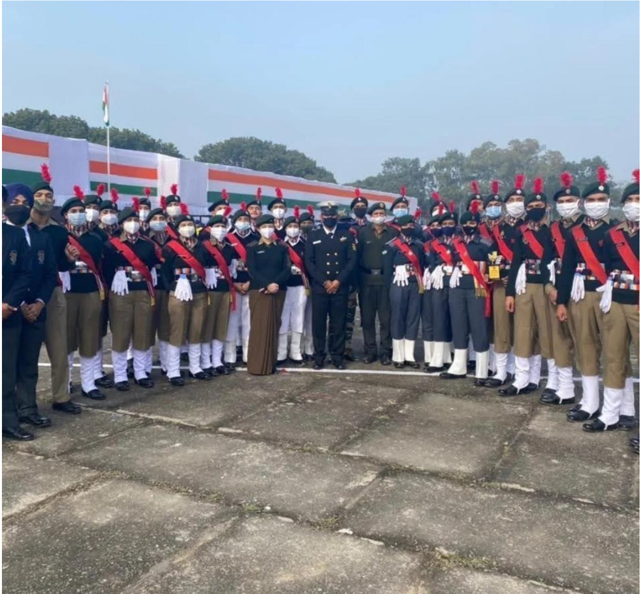
• Best Contingent Trophy on Republic Day Parade at sector 17