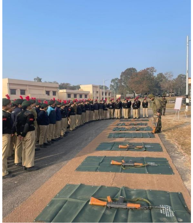
● Firing Practice during ATT camp