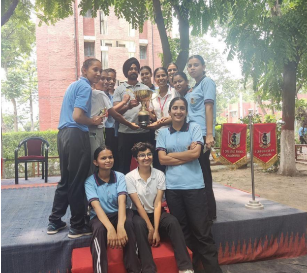
● Best Company Award 2022

selected for PRE-RD 2023 , with the highest participation from our college, held at NCC Academy, Ropar in November.