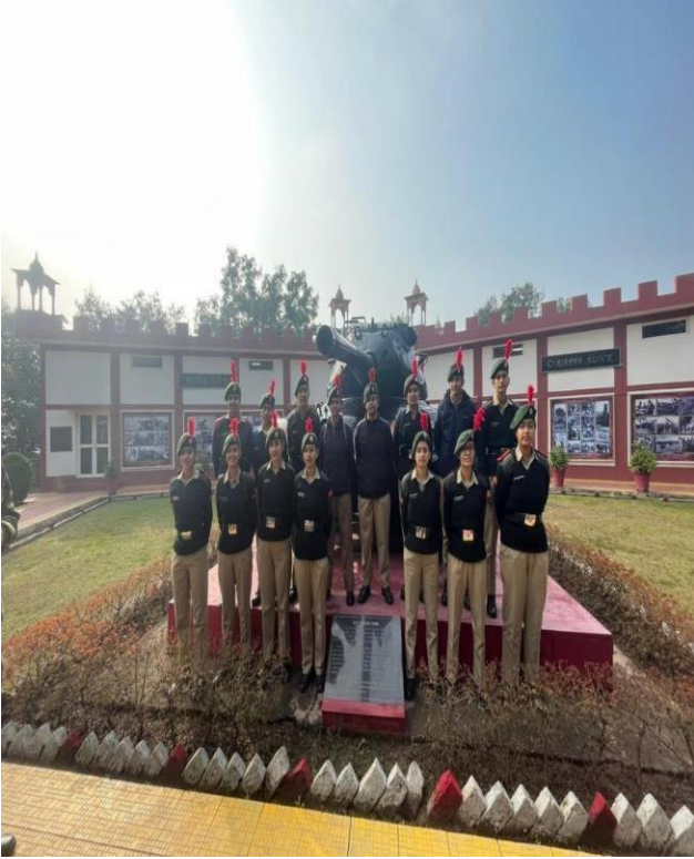
● Cadets Outing at War Museum