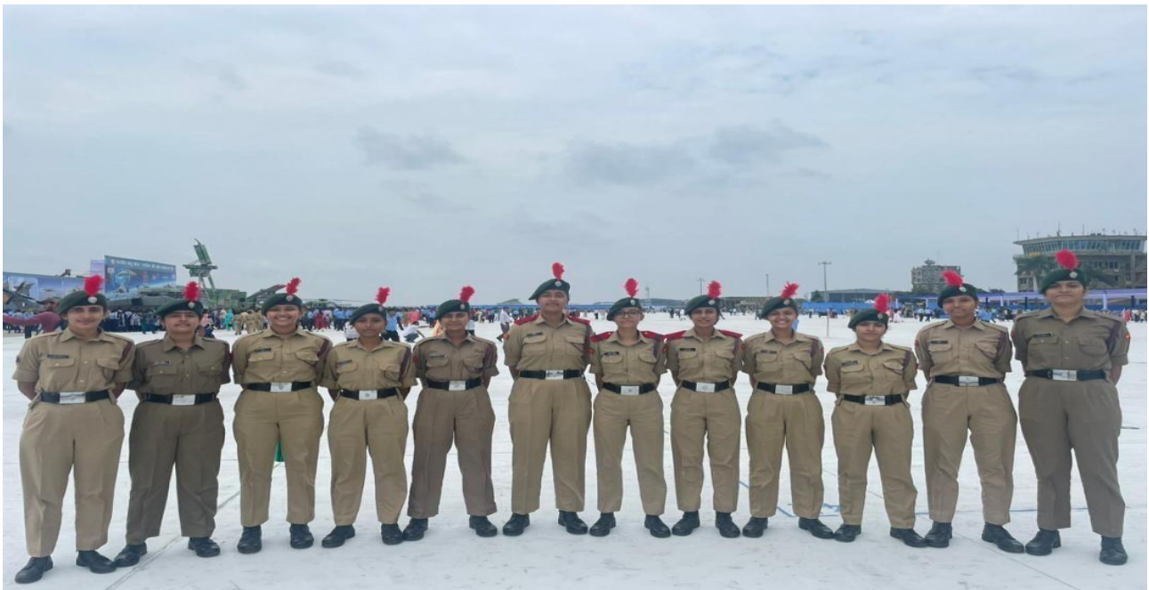
● Cadets attended Air Force Day Parade at Air Force Station