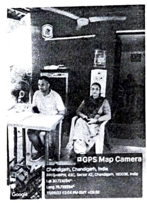
Female Constable at the Gate