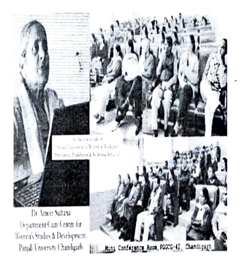
Awareness Talk on Sexual Harassment Act, 2013