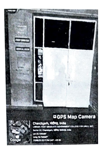
Medical Room and Student's Common Room