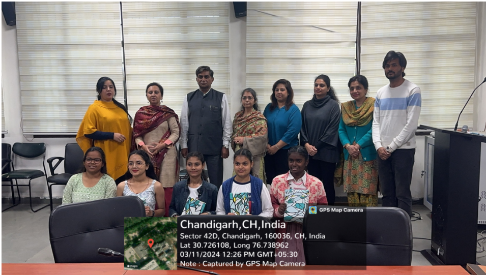
GPS Map Camera Chandigarh, CH, India Sector 42D, Chandigarh, 160036, CH, India Lat 30.726108, Long 76.738962 03/11/2024 12:26 PM GMT+05:30 Note : Captured by GPS Map Camera