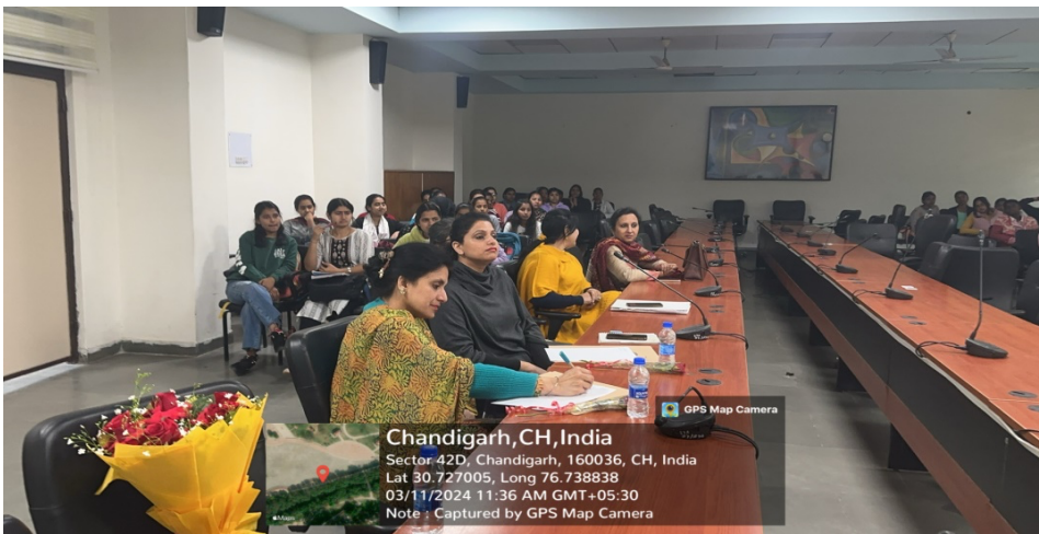
GPS Map Camera Chandigarh, CH, India Sector 42D, Chandigarh, 160036, CH, India Lat 30.727005, Long 76.738838 03/11/2024 11:36 AM GMT+05:30 Note : Captured by GPS Map Camera