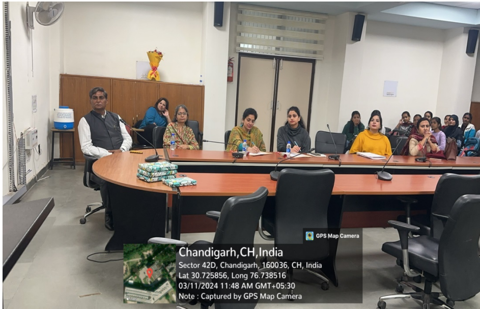
GPS Map Camera Chandigarh, CH, India Sector 42D, Chandigarh, 160036, CH, India Lat 30.725856, Long 76.738516 03/11/2024 11:48 AM GMT+05:30